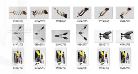
Product Images <u>DAM Download</u>